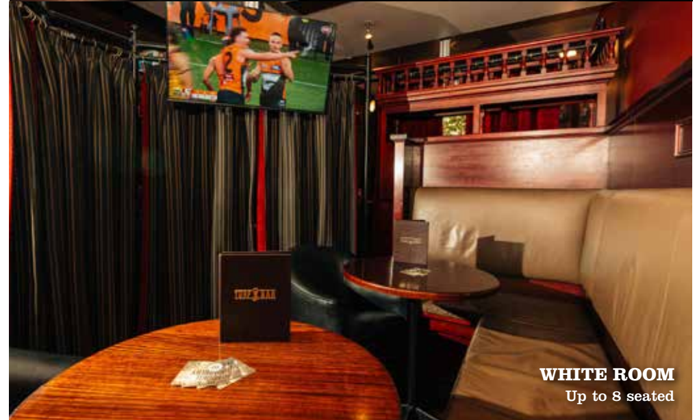
WHITE ROOM Up to 8 seated