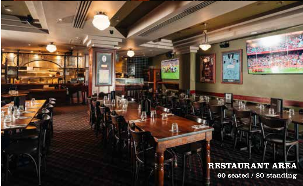
RESTAURANT AREA 60 seated / 80 standing