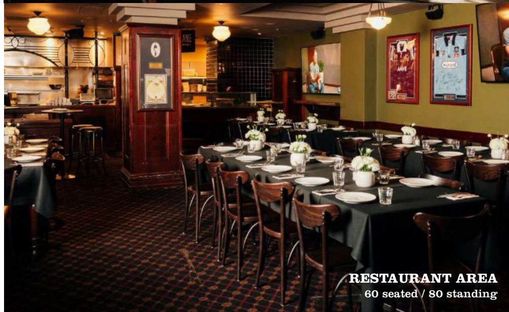
RESTAURANT AREA 60 seated / 80 standing