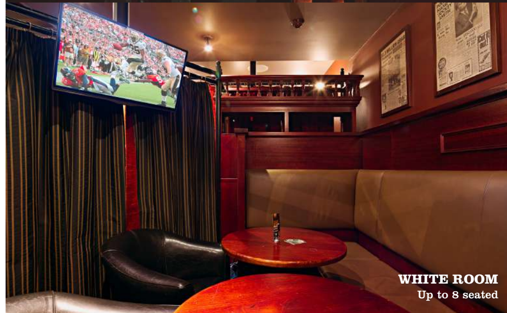
WHITE ROOM Up to 8 seated