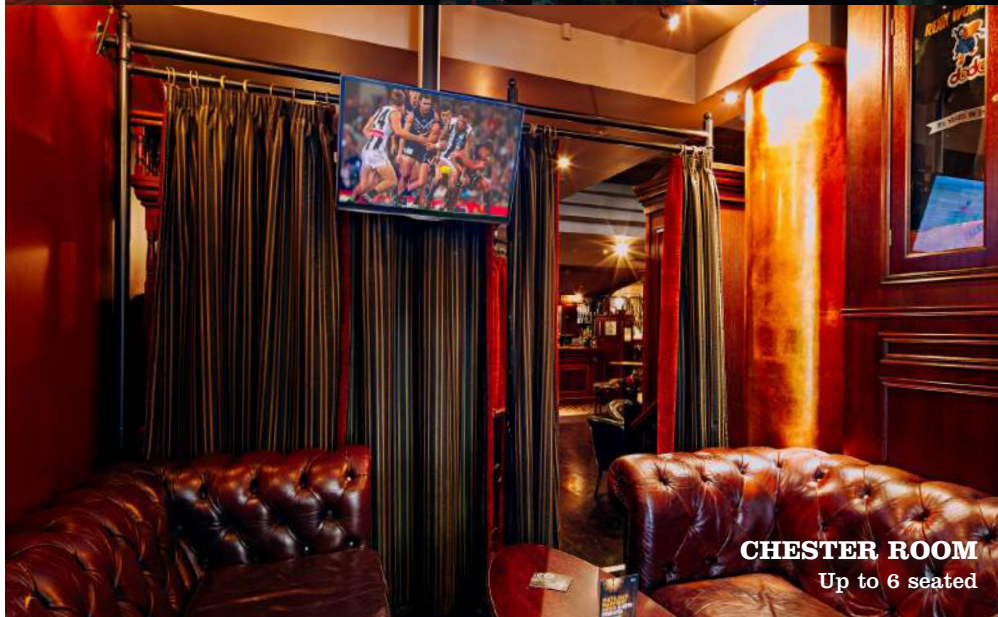
CHESTER ROOM Up to 6 seated