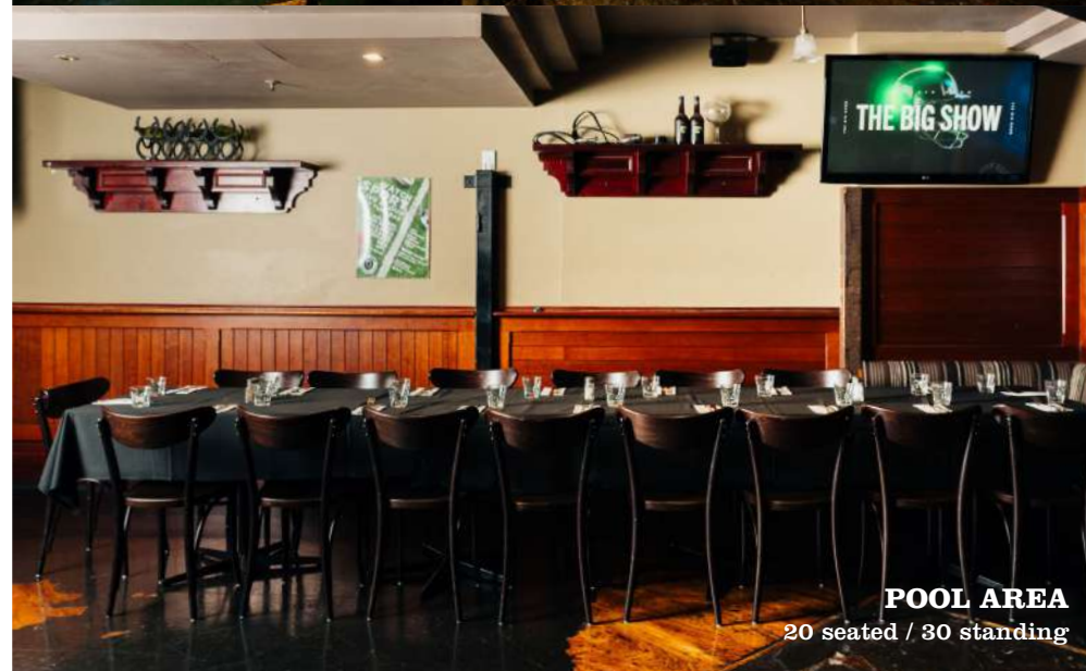
POOL AREA 20 seated / 30 standing